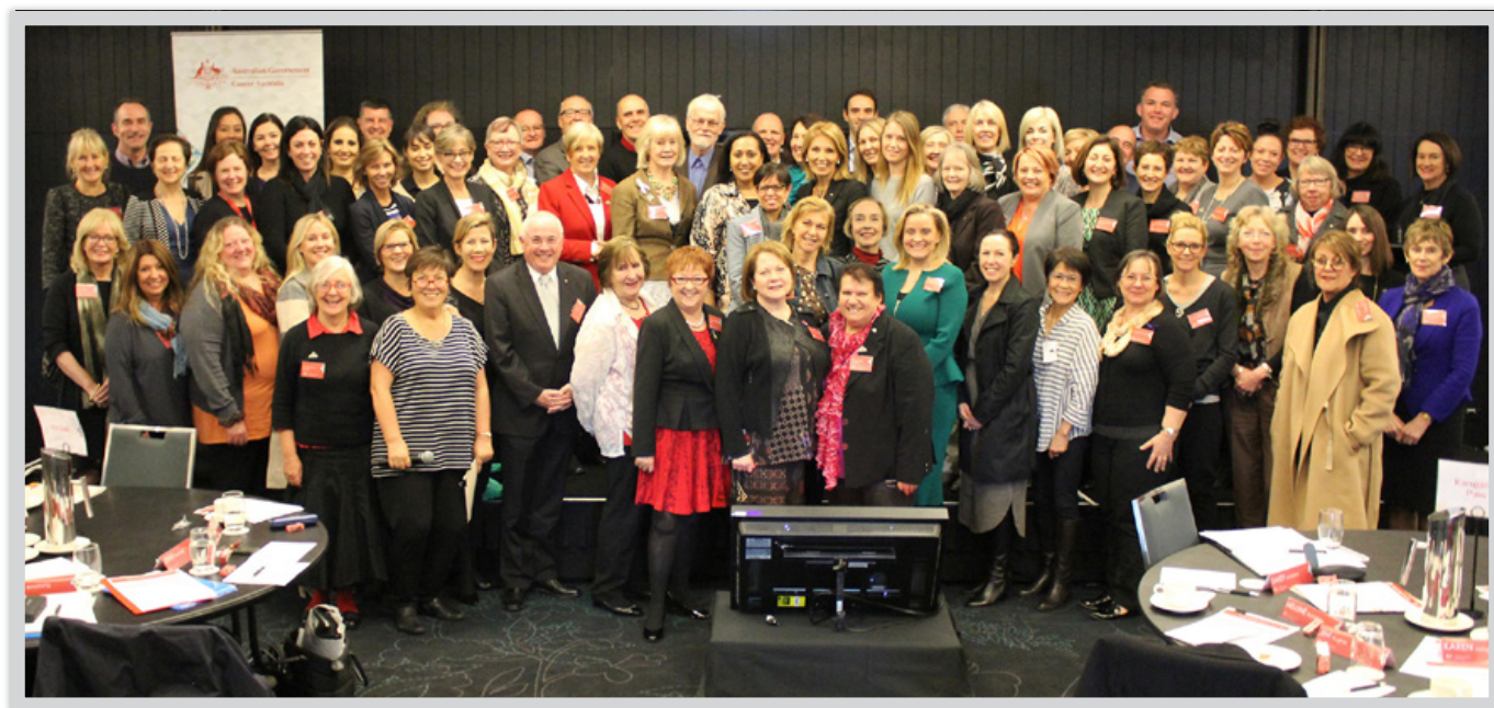
Consumers in the room - Cancer Australia Consumer Forum.