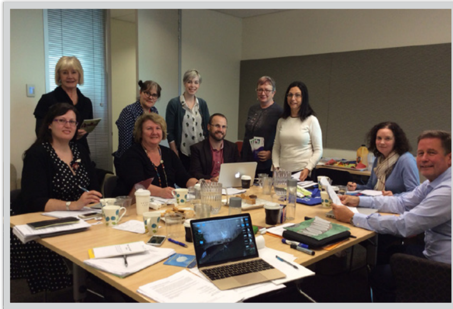
BTAA Steering and Project Committee Meeting, Melbourne.